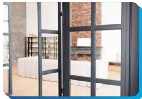
High Res Building