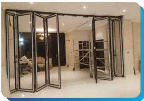
Doors & windows